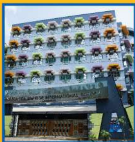
Bombay Cambridge International School Andheri (East)

022 61149000 / 99309 36494 contactus@dsrvmalad.org www.dsrvmalad.org