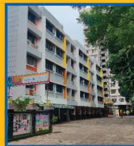
Dr. S. Radhakrishnan International School Borivali (West)