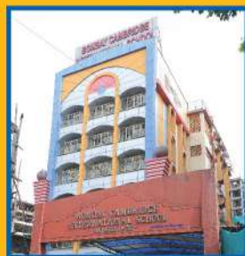
Bombay Cambridge International School Andheri (West)