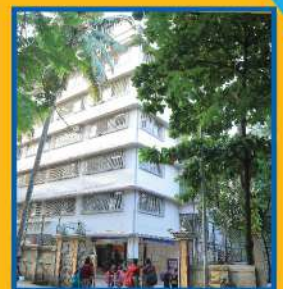
Veer Bhagat Singh International School Malad (West)