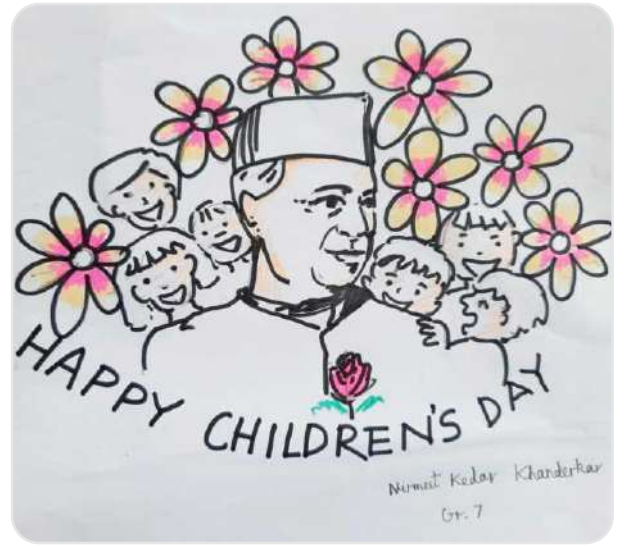
Submitted by Nirmeet Khandekar Class 7