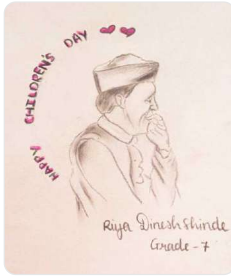
Submitted by Riya Shinde Class 7