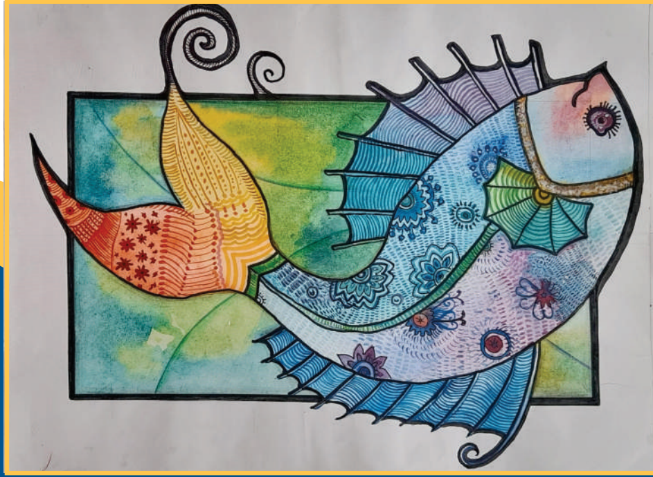
Submitted by Saish Rane Std 8th C, DSRVM